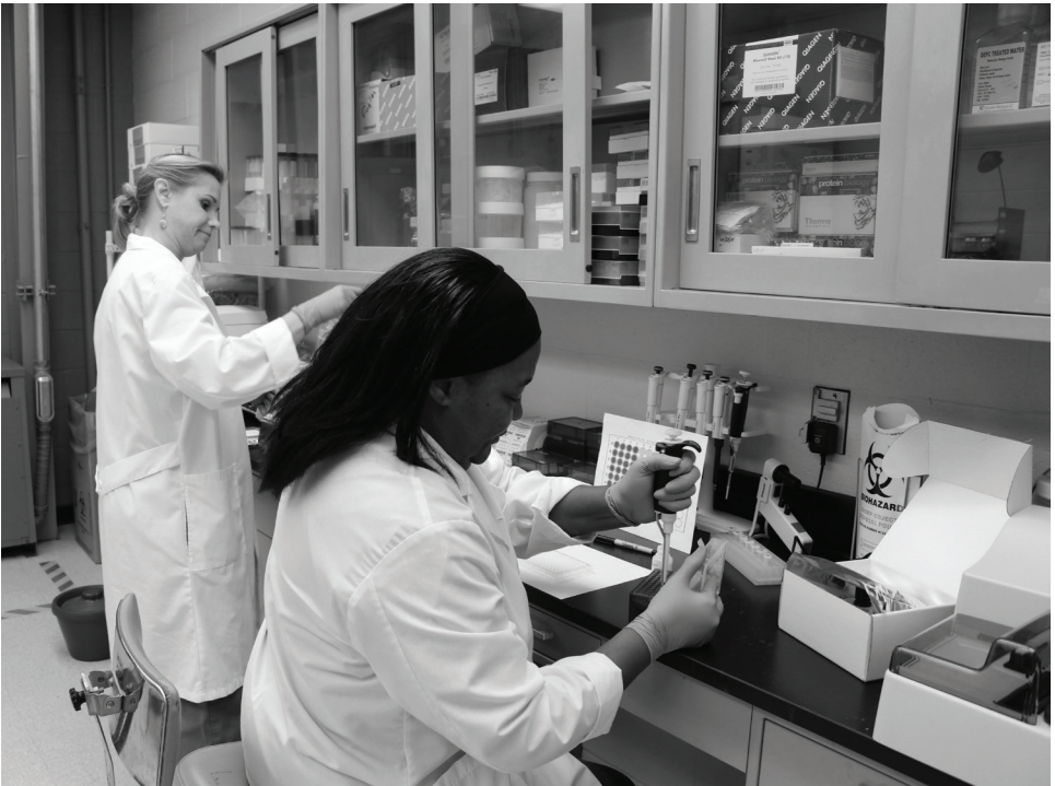
We Discover: The LSU School of Veterinary Medicine investigates a variety of diseases.

The safest and most effective method of preventing rabies in high risk groups is by pre-exposure vaccination. Because the risk of exposure is especially high for students of veterinary medicine, it is the policy of the School of Veterinary Medicine that all students must receive pre-exposure rabies vaccine before or during the fall semester of their first year in the professional curriculum. The vaccine will be available through the LSU Student Health Center for enrolled veterinary medicine students.