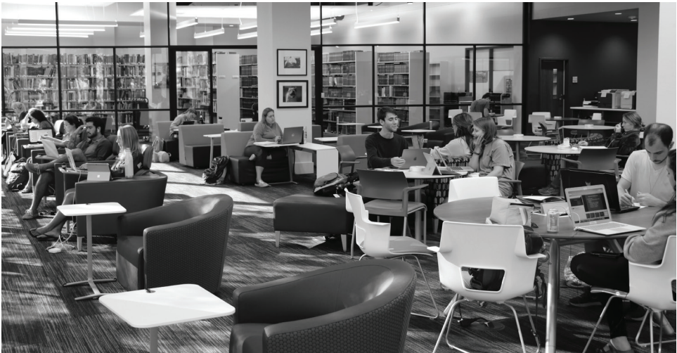
We Teach: The LSU Veterinary Medicine Library is accessible 24/7.

All fees are estimates and the LSU Board of Supervisors may modify tuition and/or fees at any time without advance notice. Check current tuition and fees at www.lsu.edu/bgtplan/Tuition-Fees/fee-schedules.php .