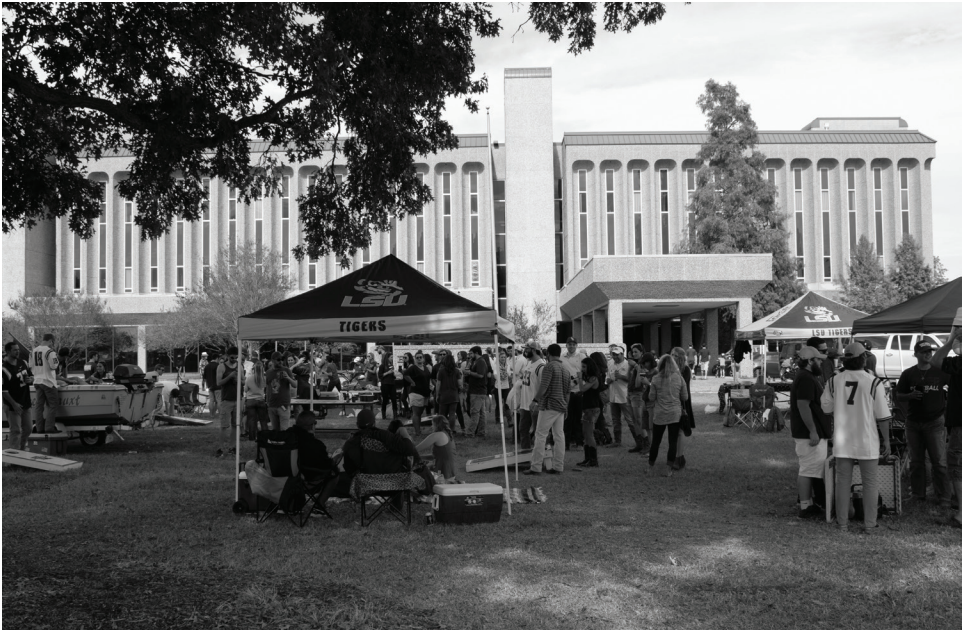
Fall in south Louisiana means LSU Tiger football and tailgating.

The Department of University Recreation provides a variety of recreational activities. To meet the diverse needs and interests of the University community, a multifaceted recreational program is offered that includes aquatics, informal recreation, healthy lifestyle programs, intramural sports, adventure recreation, sport clubs, and special event activities. For additional information, contact the Department of University Recreation.