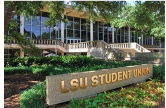
Image: Front of LSU Student Union