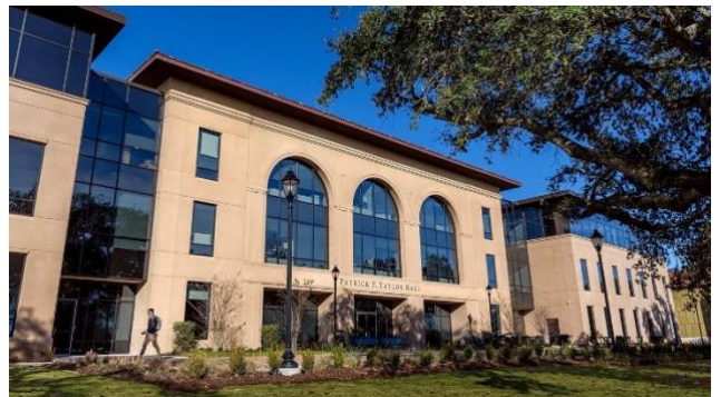
Image: Front of Patrick F. Taylor Hall