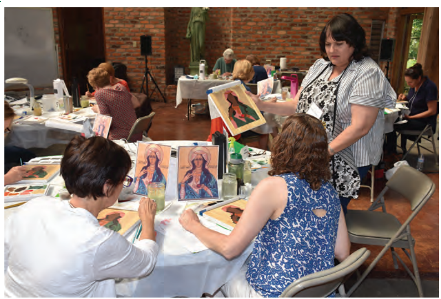
April icon workshop attendees focused on Mary Magdalene.

pants return for each new workshop, there are always newcomers who eagerly devote a week of their time and energy for the chance to learn about iconography and to create an icon of their own.