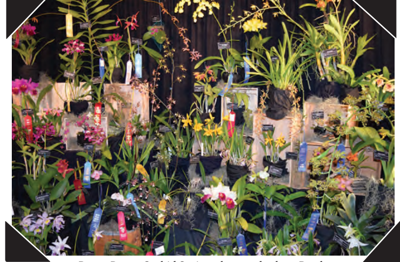
Baton Rouge Orchid Society show and sale at Burden