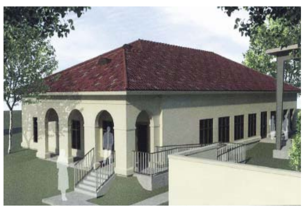
An architectural rendering of the classroom to be constructed at the PERTT Lab.